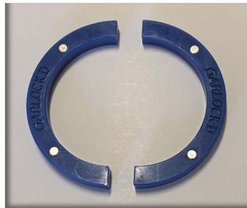
Figure 1: Single Split Ring with Magnets

Compression packing used in heavy duty slurry pump applications must be correctly installed to achieve a desired outcome. Each packing ring needs to be installed and seated with recommended level of compression for the material being used. This is achieved with the use of a Tamping Tool that transfers the load from the gland follower to each ring of packing during Installation.