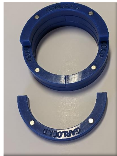
Figure 2: Split 3 Ring Set

Garlock Provide Sets Specific to your Pump Dimensions