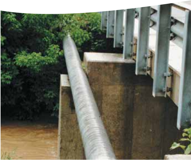
Wax-Tape® #2 anticorrosion wrap has a proven history over three decades of successful field applications. It is used with Trenton primers, profiling mastics and outerwraps to create the Trenton Wax-Tape® System.