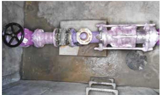
Wax-Tape® #2 anticorrosion wrap is available in many colors. This pipe is wrapped in purple tape, often used in the water industry.

*Also available in purple, yellow, red, blue and green