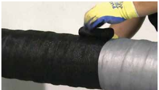
For some exposed applications, or applications requiring additional mechanical protection, Trenton recommends the use of an outerwrap. Trenton MCO® 110 moisture-cured outerwrap (shown above) provides excellent mechanical strength and quick curing times.