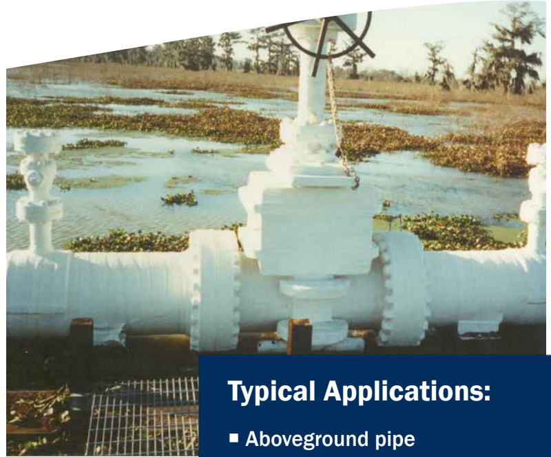
The Wax-Tape® anticorrosion wrap system is particularly effective in situations where it is difficult to abrasion blast.

Trenton Wax-Tape® #2 anticorrosion wrap is unique in that it is soft and pliable then firms up to form a long-lasting, highly effective protective coating. The wrap is composed of microcrystalline waxes, plasticizers, corrosion inhibitors and other ingredients saturated into a nonwoven, nonstitch bonded synthetic fabric. There are no siliceous mineral fillers.